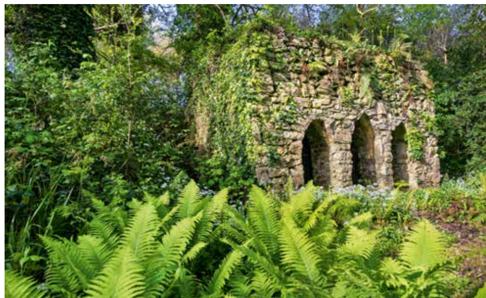
The Gothic hermitage, a romantic structure set amid Nature—wild and mysterious

meadowy hill beyond with an elegant, low, scalloped wall. A little stream bordered in fuchsia rushes under the twisted arms of the ancient primeval Killarney oaks, all covered with moss and polypody ferns. This contrast of smooth and rough, Nature tamed and cultivated beside the wild and mysterious, is what makes the composition so effective.