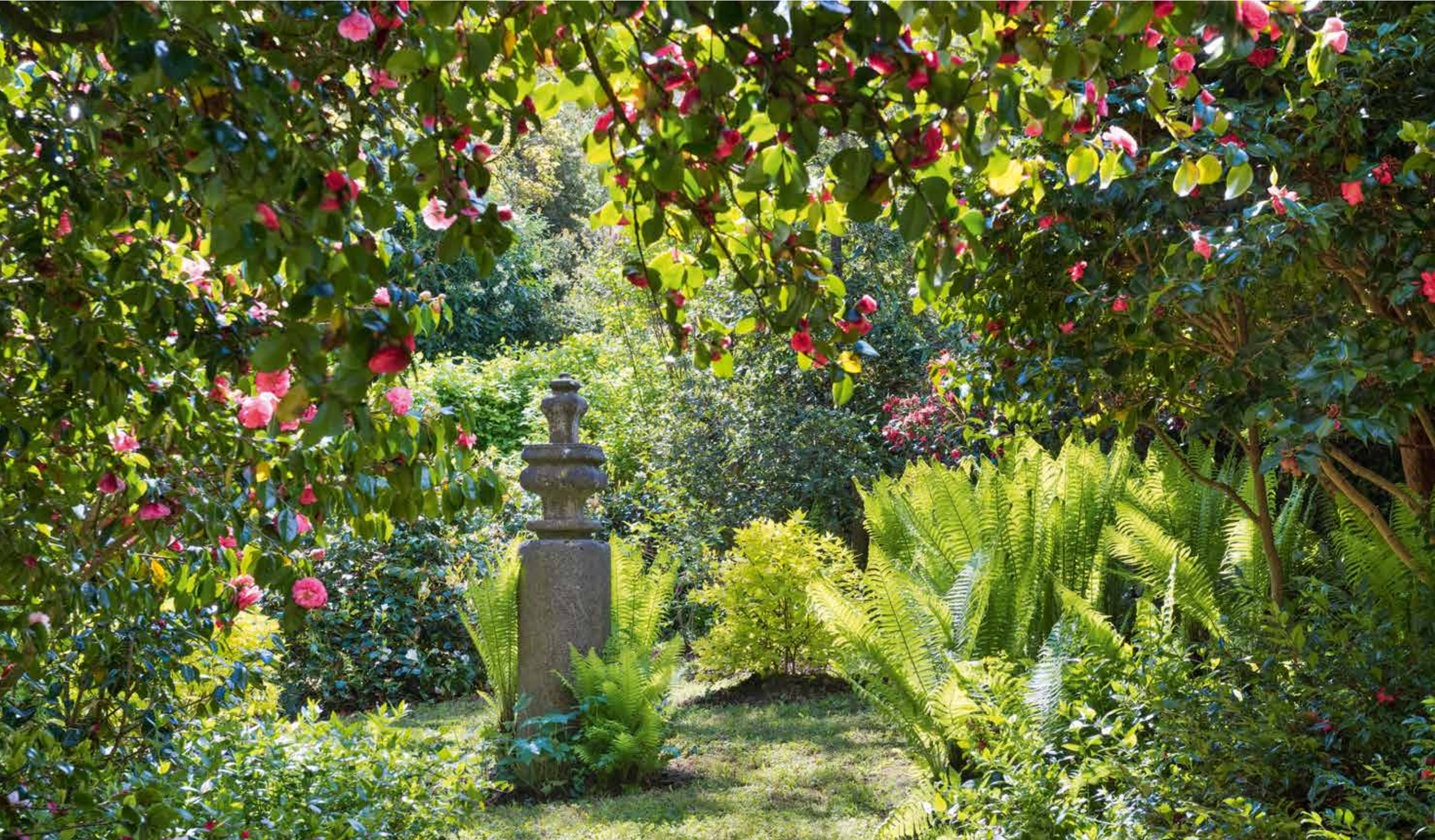
Previous pages: Glin Castle, framed by cedar and pine, with the River Shannon beyond. Above: The tranquil beauty of a camellia glade

THE north front of Glin Castle, Co Limerick, was built on the shores of the broad Shannon estuary in the 1780s. It looks out over a stretch of green fields, dotted with grazing black-and-white cows and flocks of visiting long-beaked curlews and crested peewits, to the sweep of water beyond. On stormy days, gales sweep in and batter the sea wall and the stark, bow-fronted façade, but, in clear, calm weather, the water is as smooth as glass and the patchwork of fields in neighbouring Co Clare is lit up in every tiny detail.